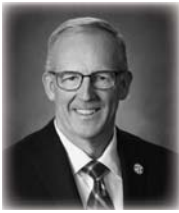
GREG SANKEY Commissioner